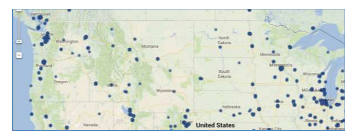
ParkMe parking locations within the North/West Passage states